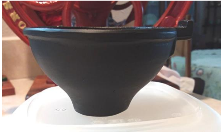
Side Profile View of Catch Cup

Below and on the following pages are shown the many coffee mills made by The Coles Manufacturing Company and later by The Braun Company. The mills on the first 3 pages were made from 1891 until around 1910, although models continued to be popular in remote homes and stores before rural electricity was more widespread in the 1920's and 1930's.