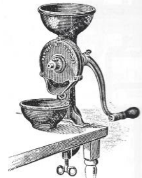
No. 0 Clamp-On Mill - Holds 5 oz. of coffee and weighs 8 1/2 lbs.