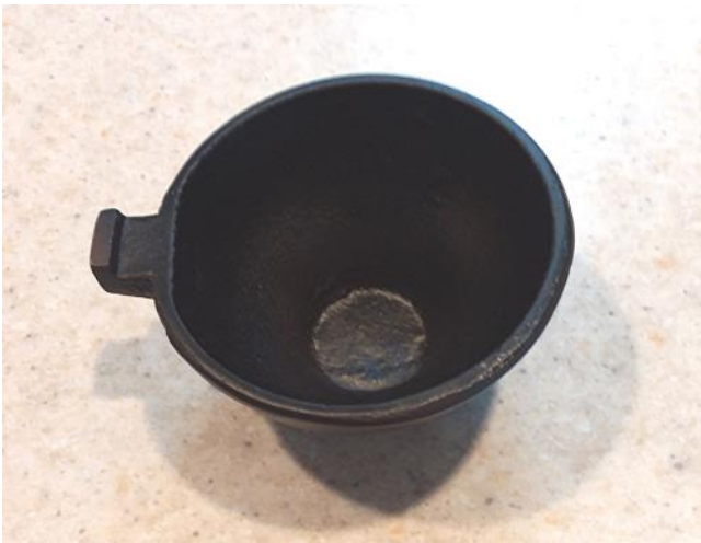
Top Angled View of Catch Cup

Finally, with input from one of Chevy Shop's customers, we decided that this particular catch cup fits the Coles model #00, a wall mount (see p. 152, MacMillan Index). I have never seen a Coles #00 in real life. If you have one, please send me a photo to post in the next Grinder Finder. And if you don't have a catch cup for your Coles #00, contact Greg at gcoleman@frontier.com . His phone number is listed in the ad for Chevy Shop Custom Casting a few more pages later.